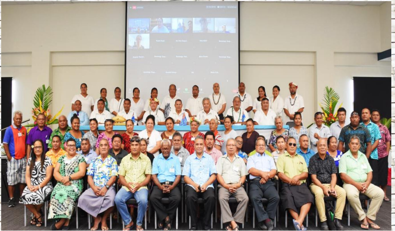
Figure 1: Group photo of the National Summit on Sustainable Development, 5 th November 2020