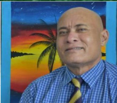
Hon. Seve Paeniu Minister for Finance

I am pleased to present Te Kete on behalf of the people of Tuvalu. Te Kete is the platform upon which we are able to overcome the socio-economic challenges and environmental crises in this period of the “new normal” we are now experiencing. Moreover, the Coronavirus pandemic has challenged our nation to think beyond the box and to resolve the unexpected associated crisis so our people can continue to live sustainable and satisfying livelihoods.