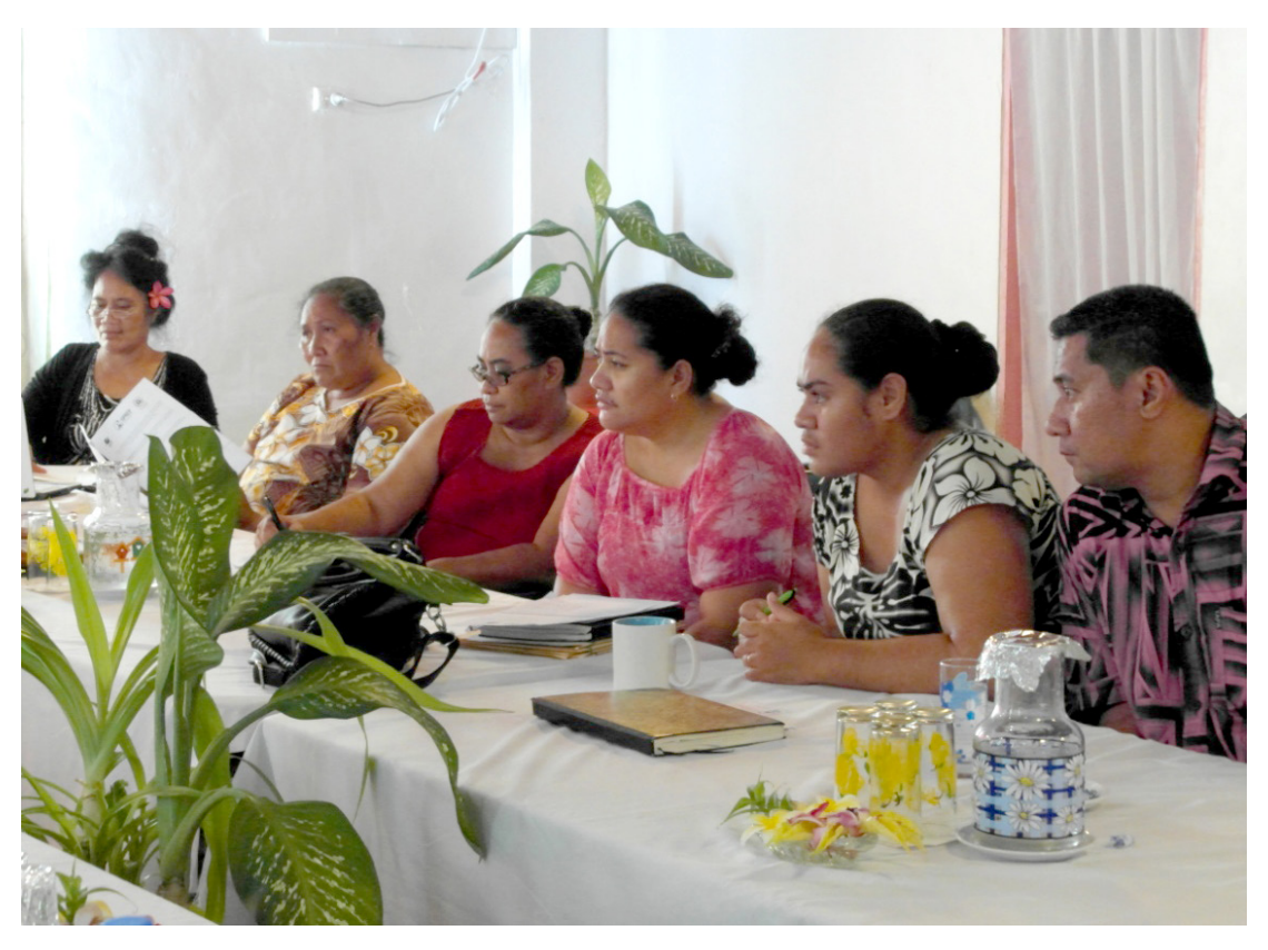
NEMS Environment Governance Consultation.

To strengthen capacity and institutional frameworks for environmental planning and monitoring, management and sustainable development.