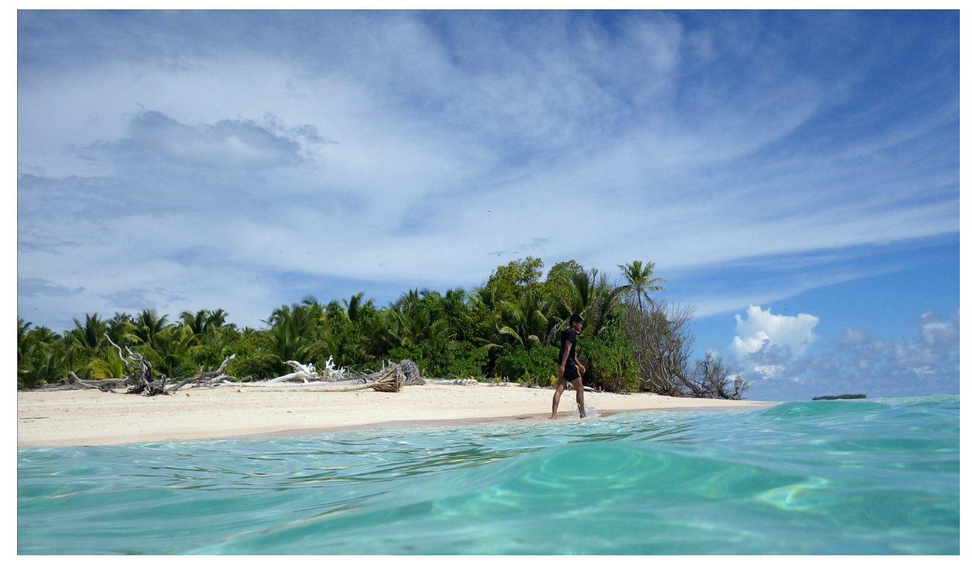
Mulitefala Islet.