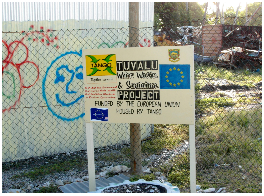
Funafuti Rubbish Dump.