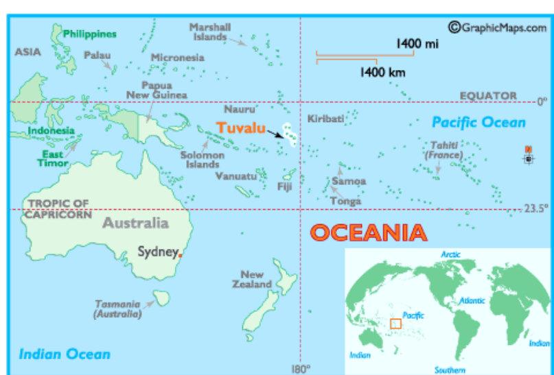
Location of Tuvalu on World Map.